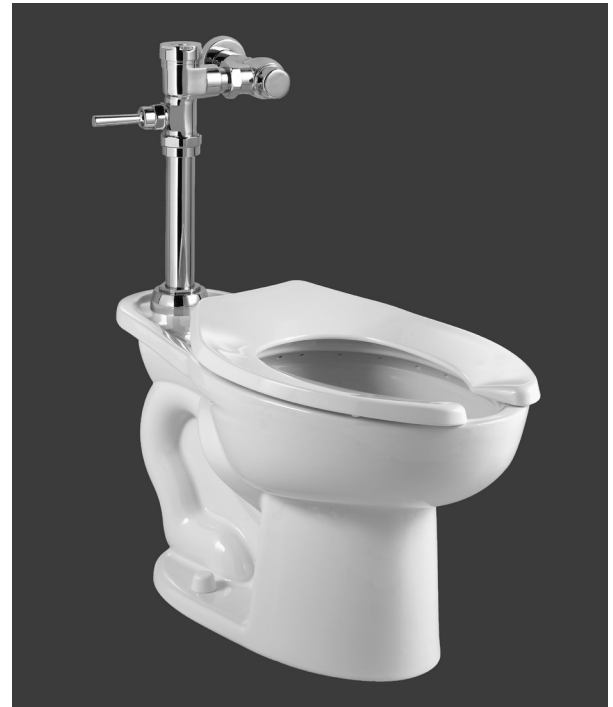
SEE REVERSE FOR ROUGHING-IN DIMENSIONS